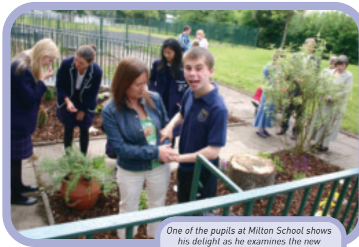
One of the pupils at Milton School shows his delight as he examines the new garden.

The result of all the pupils' efforts is impressive: aesthetically Milton School garden has improved greatly, but more importantly the children have been provided with a very practical resource that