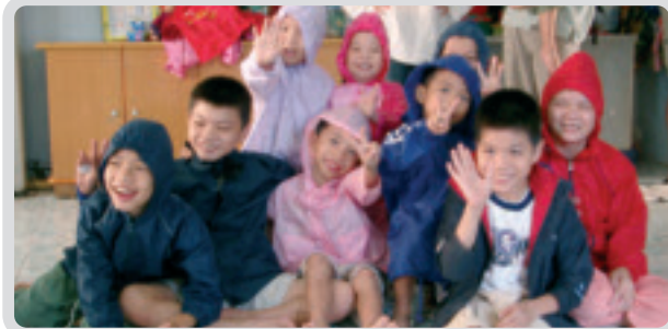
SMILING IN THE RAIN: Atholl pupils brought in raincoats for the children in the Hoi An Orphanage in Vietnam. Now it's the rainy season in Vietnam and the raincoats were ideal.