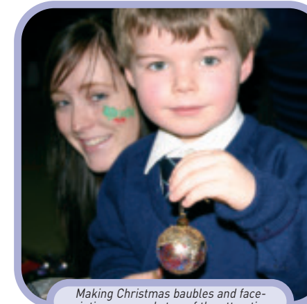
Making Christmas baubles and face-painting were only two of the attractions

The S6 charities committees have been busily organising events this term and the message seems to be clear: if it involves dressing up, they're all for it! Consider the evidence: