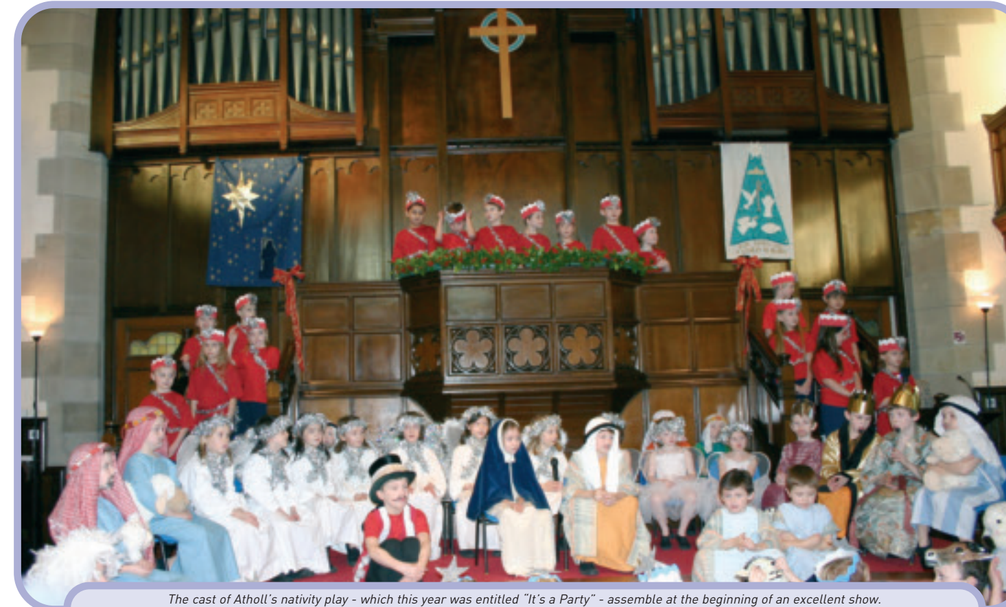
The cast of Atholl's nativity play - which this year was entitled "It's a Party" - assemble at the beginning of an excellent show. Dairsie's nativity play - held in Newlands South Church - was an equally imaginative performance.

Anyone passing the site of the new Prep School will have been amazed at the rate at which the building has been taking shape since the end of the summer. Once the essential, but