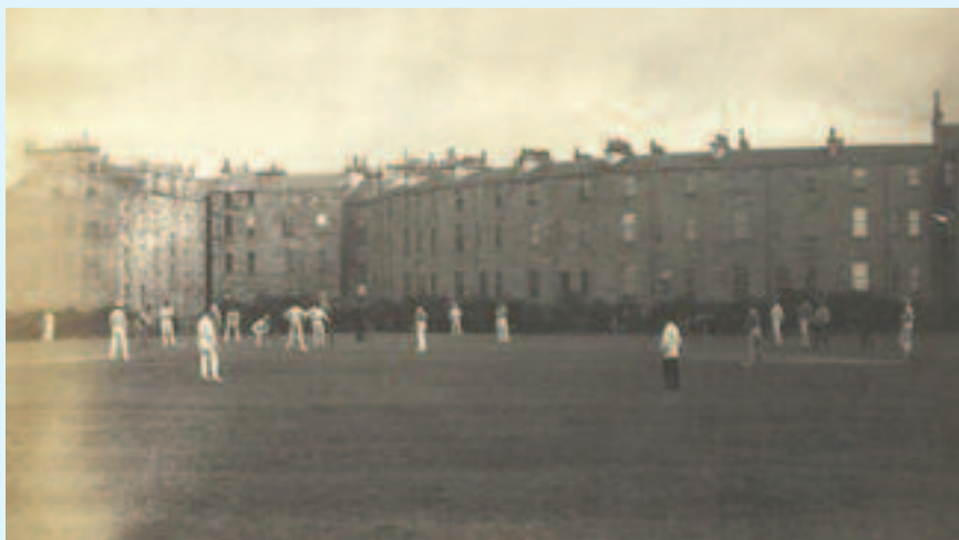
A cricket match in progress at Burnbank in the 1870s