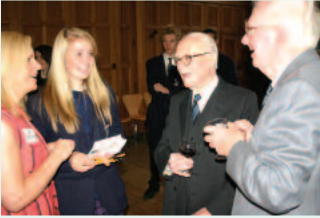
The evening was enjoyed by young and old alike.

Foreign honours including two VCs. Then I opened the Roll of Service 1939-45 and read how 1,646 Academicals had served their country in the Second World War; 168 had lost their lives and 349 were awarded honours, one of whom was the very first serviceman to receive a medal for gallantry in October 1939.